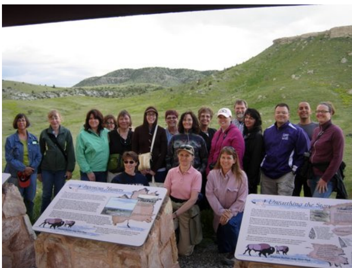
2010 Project Archaeology Leadership Academy participants toured the Madison Buffalo Jump and learned Crow perspectives on regional archaeology.