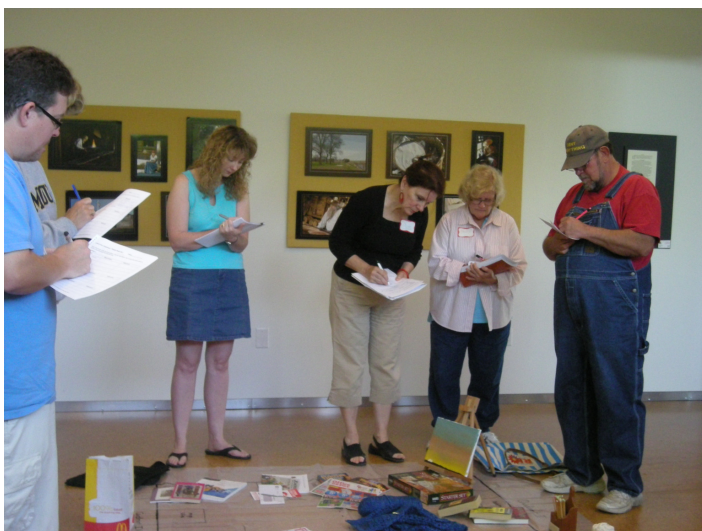
Teachers at Fort Osage, MO analyze modern artifacts as part of their instruction in archaeology.