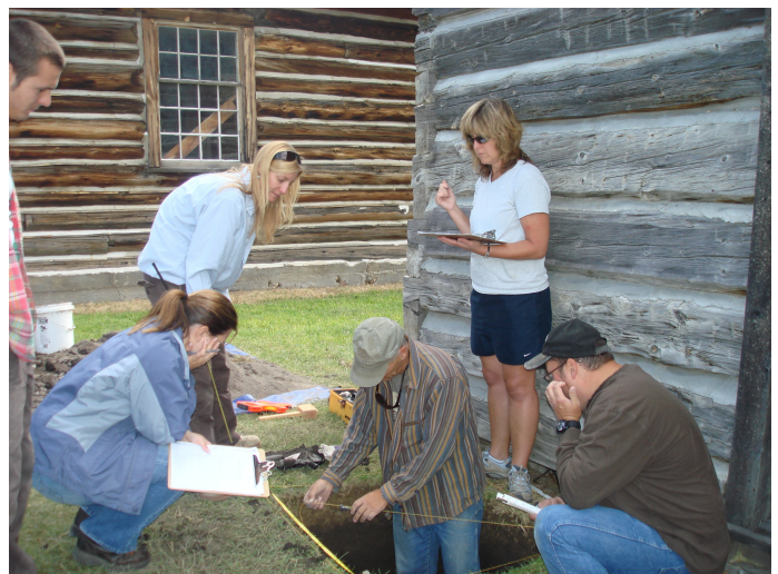
Teachers spent two days excavating a historic foundation at Virginia City, MT following a Project Archaeology workshop.

Each active state or regional program maintained one or more partnerships with State Historic Preservation Offices, universities, federal agencies, or state professional societies. Newly developing programs are establishing similar partnerships to plan and implement state, local, or regional programs. Notable state partnerships include the National Museum of Natural History (Smithsonian Institution), Alabama Wildlife Foundation, Sierra Mono Museum (CA), Timucuan Ecological and Heritage Preserve (FL), Herbert Hoover Presidential Library (IA), Kansas Department of Education, Riverside Farnsley-Moreman Landing (KY), Jackson County Parks (MO), Montana Preservation Alliance, El Paso Museum of Archaeology (NM), Great Basin National Park (NV), Pennsylvania Archaeological Council, and Friends of Bells Bend Park (TN).