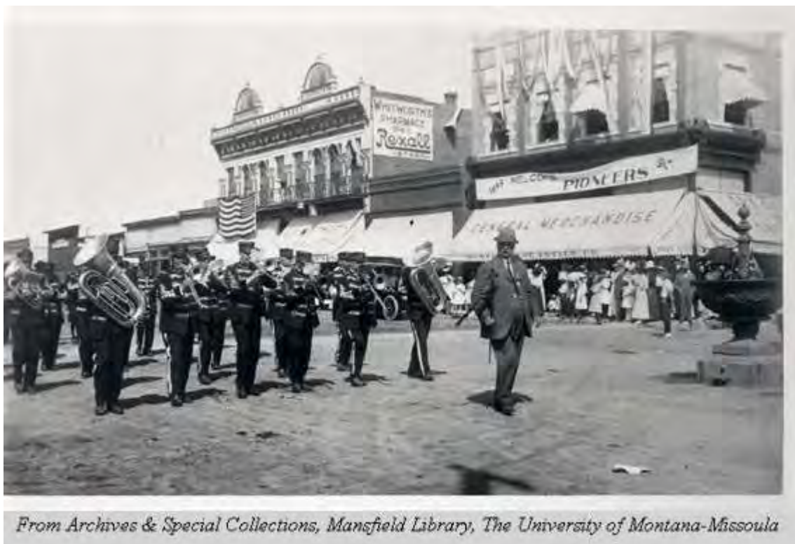
Figure 7 - "Parade in Downtown Deer Lodge Honoring the Pioneers," August, 1912, Deer Lodge, Montana.