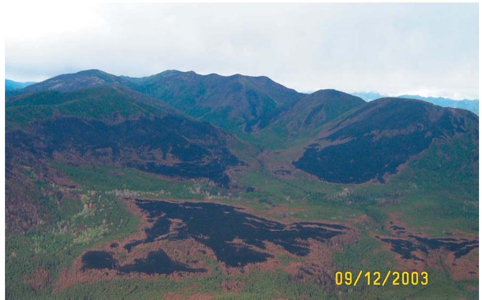
The Apgar Mountains, burned in the Robert Fire of 2003, show the mosaic pattern that most wildland fires leave on the landscape.

Since the necessity for fire in a fully-functioning, western ecosystem has been recognized, Glacier’s fire managers try to allow naturally ignited fires to burn whenever possible. However, this is not always feasible. There are many situations where it is merely too danger-