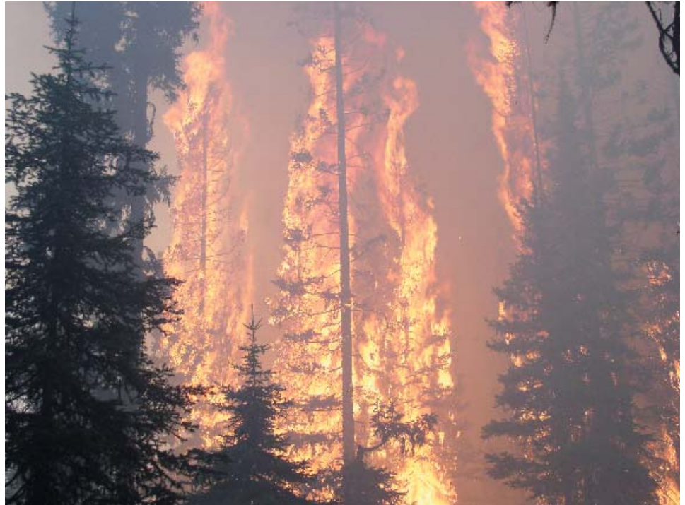
The Wedge Canyon Fire of 2003 started in the Flathead N.F. where it was managed as a "full suppression fire." When the fire moved eastward into Glacier, it was still managed as a suppression fire but with "Appropriate Management Response" which includes using suppression, prescription, and wildland fire use techniques, with a goal to minimize firefighting damage.

A general practice with early land management agencies was to stop all fires. Up until the 1960s, most managers and the public thought of fire as only a bad thing. Over the years, however, research revealed that fire was a natural process that improved habitat for many wildlife species and maintained certain forest types. Today, park staff employs a combination of suppression, prescription, and