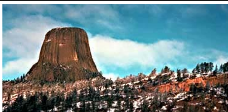
Figure 1: Devils Tower

The no-fly advisory zone is centered on Devils Tower, extends for two nautical miles (2 NM) during the months of July-May, three nautical miles (3 NM) for the month of June, and includes