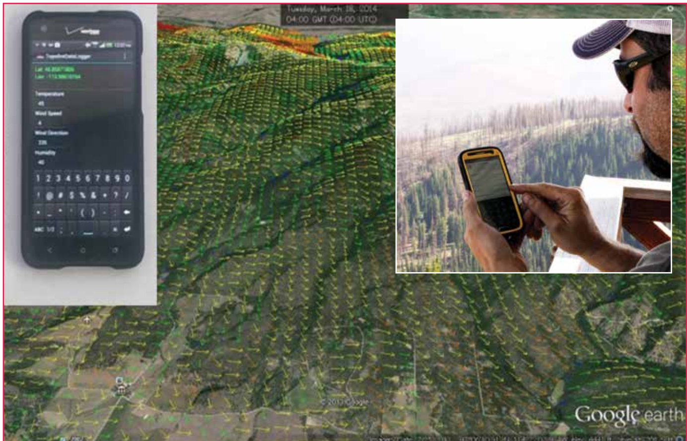
Figure 1. The TOPOFIRE smartphone application assimilates weather observations and photographs from wildfire incidents, which can be used by fire managers and fire weather forecasters. Users can also request WindNinja simulation and fire danger forecasts via phone in real time.