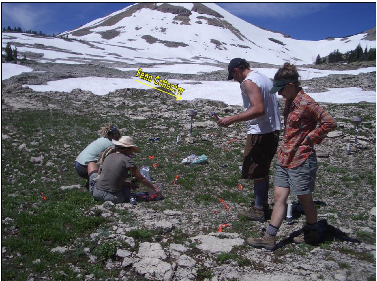
Photo 4 & 5 Plot-pair installation at Moose Basin -- orange flags mark the plot parameters.