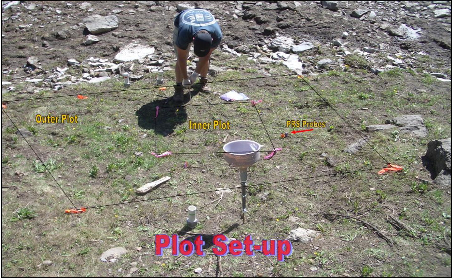
Photo 1: Plot layout -- Lines have been super imposed (drawn) onto the plots to outline them