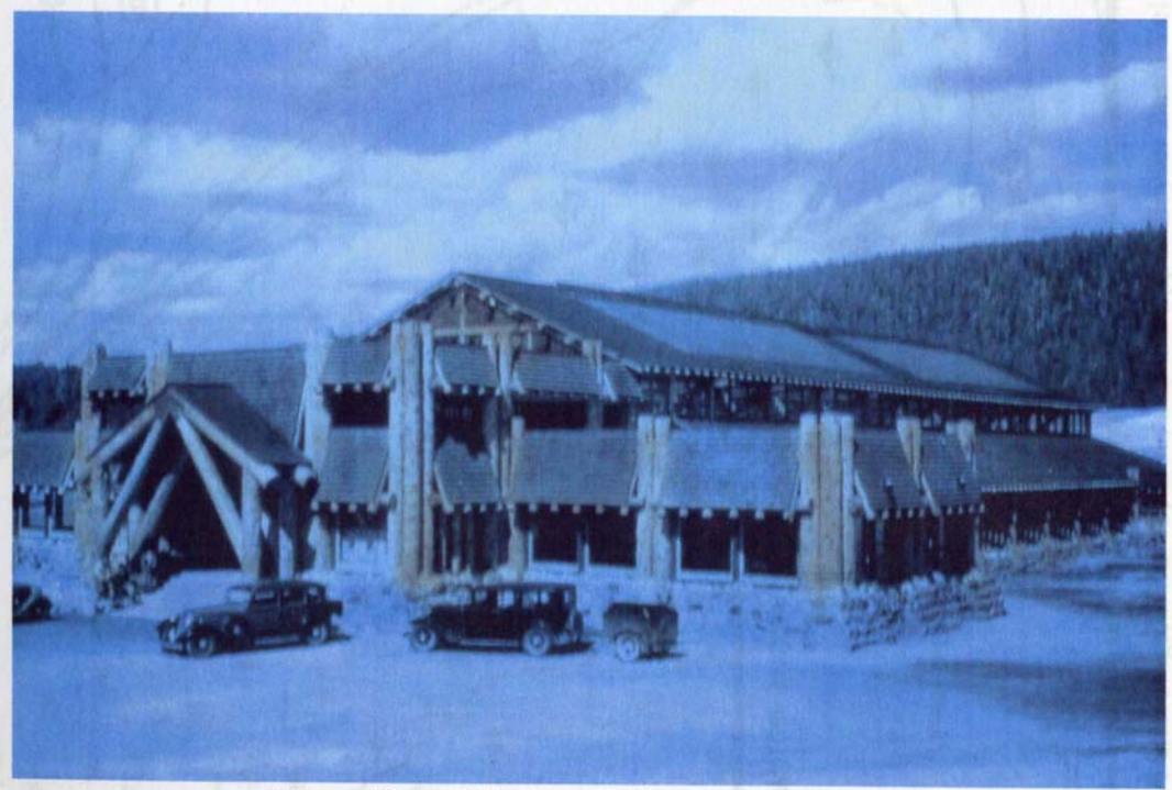
View of the 1934 renovated bath house and pool