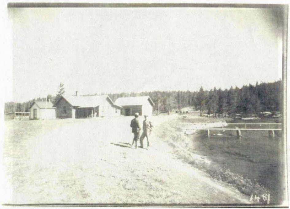
Historic view of same area as above showing the military post