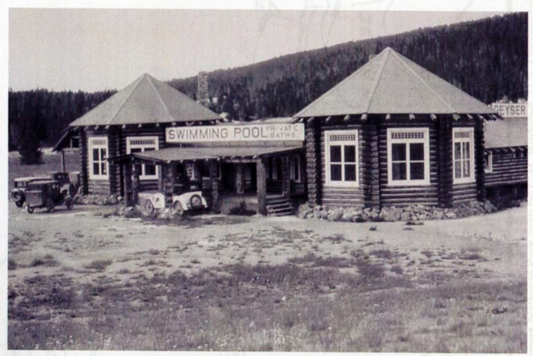
View of the front of the first bathhouse