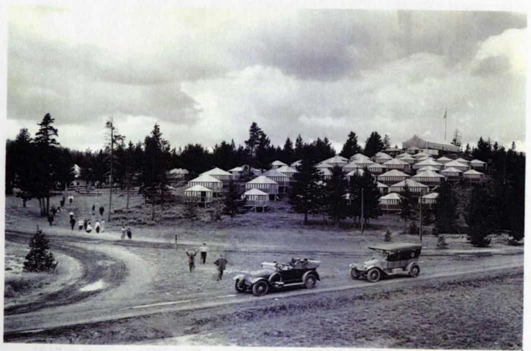
View to the northwest at the Wylie Camp on slopes of Wylie Hill in 1915, historic photograph (YELL 50774). Note large dance hall tent on top of hill where Feature 21 lies.