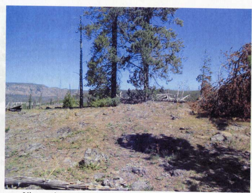
View to the northwest at the top of Wylie Hill and Feature 21