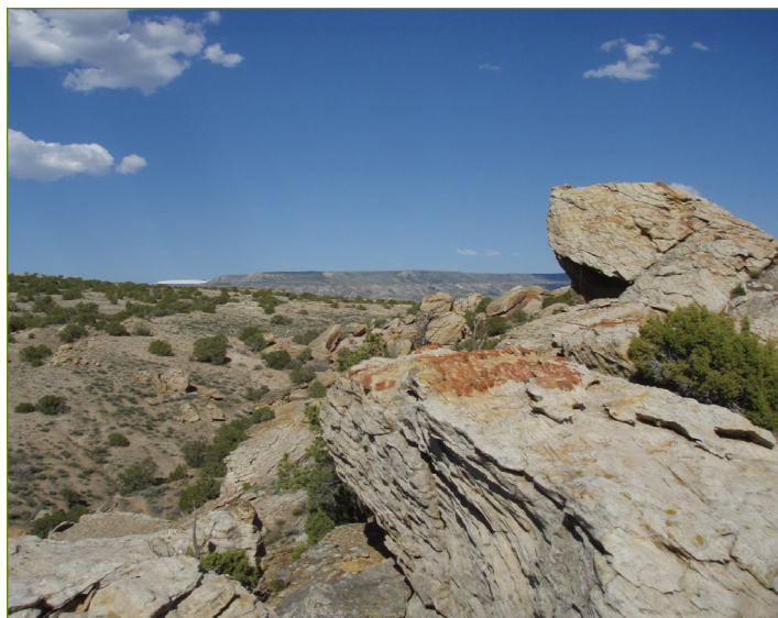
Sagebrush in Bighorn Canyon National Recreation Area.

Climate change is anticipated to cause shifts in the distribution and abundance of amphibians on a global scale. In the GRYN, impacts could include earlier breeding, resulting in more frequent exposure to killing frosts and a longer larval period because water temperatures warm more slowly in early spring, leading to higher larval mortality. Reduced water storage as snow, early runoff, and an increase in evaporation due to warmer summer temperatures may reduce habitat for adult amphibians. The GRYN is working in collaboration with the U.S. Geological Survey's Amphibian Research and Monitoring Initiative to determine the status of amphibians in Yellowstone and Grand-Teton National Parks.