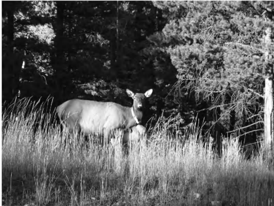
PLATE 1. Migrant and resident elk make trade-offs between risk and forage at different spatial scales. This radio-collared resident elk remained on the winter range during summer, forgoing benefits of migration to high-forage-quality migratory summer ranges but avoided predation by selecting areas close to high human use where wolves avoided humans.

advanced phenology of low-elevation summer ranges. However, avoidance of risky areas undoubtedly exacerbated the overall poorer forage quality of residents, and probably contributed to why resident elk had lower pregnancy rates than migrants (resident = 0.83, n = 63 , migrant = 0.90, n = 78 , P = 0.02 ) and reduced calf body mass (resident = 97.3 kg, n = 11 , migrant = 117.9 kg, P < 0.0001 ; see Hebblewhite [2006] for details). Environmental stochasticity in forage quality may therefore leave residents especially vulnerable. The next step is to directly link resource selection and resulting forage and predation exposure by residents and migrants to demographic differences, the true measure of the consequences of resource selection.