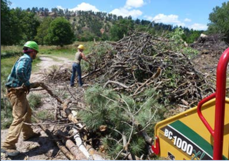
Chipping 9 Trailer and 34 Truck Loads of Brush